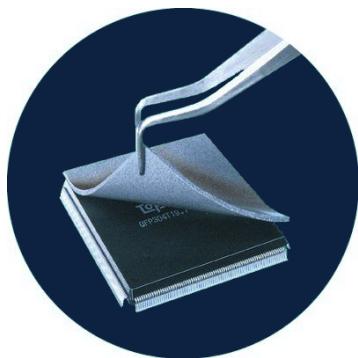
Figure 2. 3M™ Thermally conductive interface pad.

3M's acrylic interface pads provide higher levels of conductivity than comparable products on the market. These materials are durable, highly conformable, have excellent wet-out characteristics and offer substantial cost-savings when compared to silicone materials. Reported thermal conductivity is tested in accordance with ASTM D5470 test methods. 3M also subjects their materials to aging test methods, verifying durability to effectively extend OEM component life.