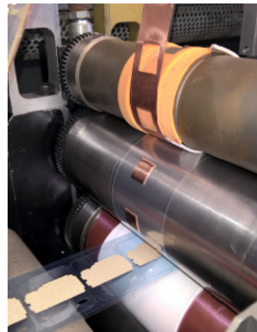
Figure 3. Rotary die cutting conversions.

Boyd Corporation provides cooling solutions across all major electronics industries. As a preferred thermal solutions provider, it maintains strategic alliances with highly qualified supply chain partners, such as 3M. Critical thermal performance criterion is addressed through a holistic design approach and is supported by a breadth of precision converting and in-house manufacturing capabilities. Procured custom converted materials and complete thermal solutions are developed that meet or exceed the requirements of the intended application while addressing target costs.